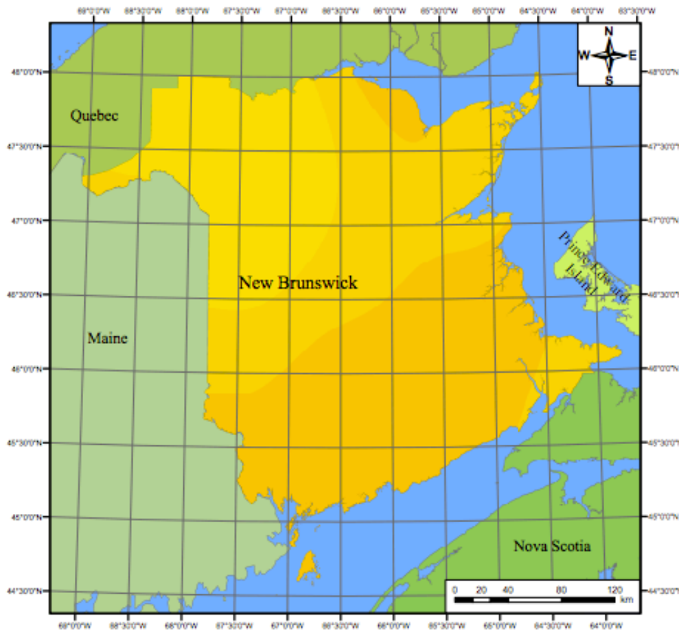
Mean Daily Global Insolation (Horizontal Surface)